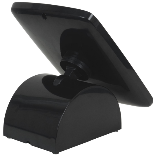
MoonBase tablet enclosure with iPad inserts and iPad fascia